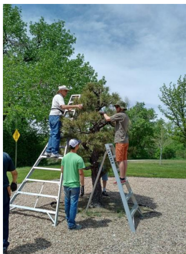
2016 – Young and Older Volunteers, Working Side by Side

Volunteers from Japan America Society of Colorado and the Takayama Sister Cities organizations joined us again in this most worthwhile community