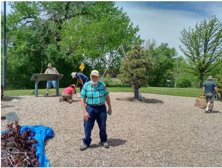
2016 – A “Job Well Done”!