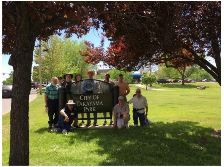
Spring, 2016 – Group Shot of Takayama Park Clean-up Volunteers